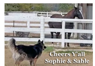
Cheers Y'all Sophie & Sable